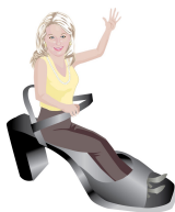
Virginia Buyer and Listing Specialists