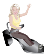
Virginia Buyer and Listing Specialists